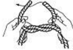
Left over right...