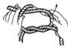
makes a knot tidy...